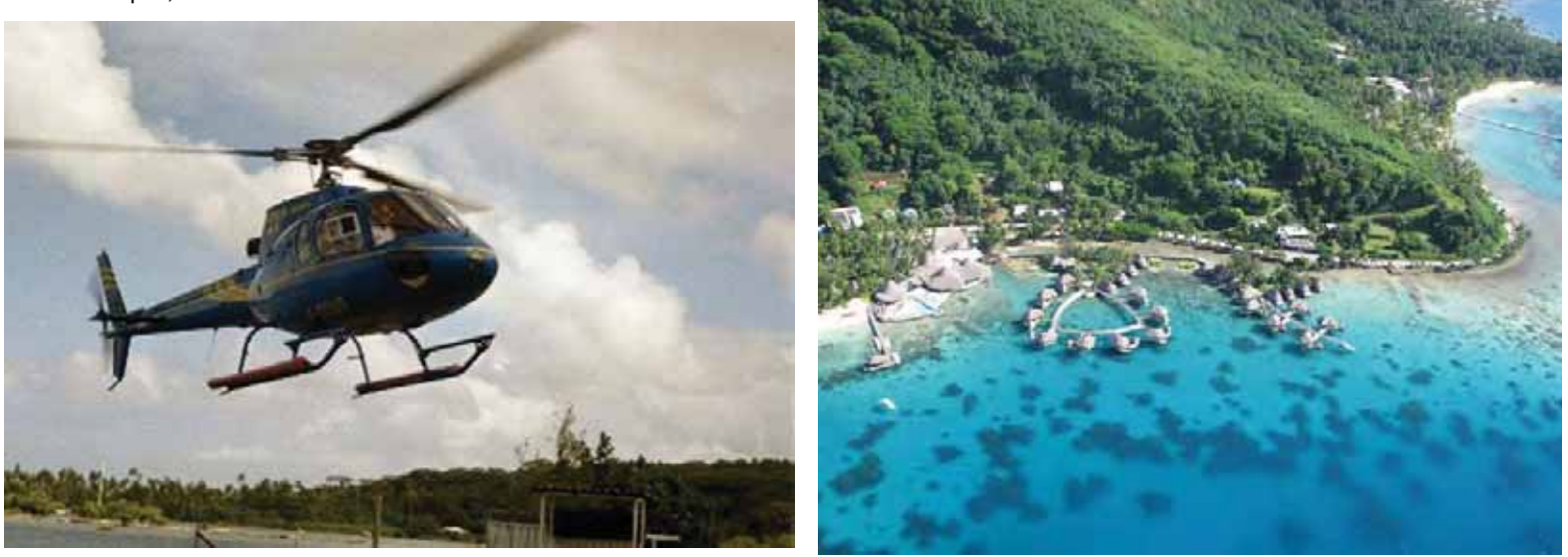
We flew around the 2 mountains, Pahia, and Otemanu, which was higher. The pilot got us close enough to show us the sacred cave in the side of Otemanu.

One of the highlights of the trip was the helicopter ride around Bora Bora. The helicopter seats 4, 3 in the back, and one in front next to the pilot. Being the gentleman I am, I let everyone get in the back first, and I sat up with the pilot. The flight around the island was spectacular, We could see the different shades of water, depending on the depth, and the hotels that are built out over the water.