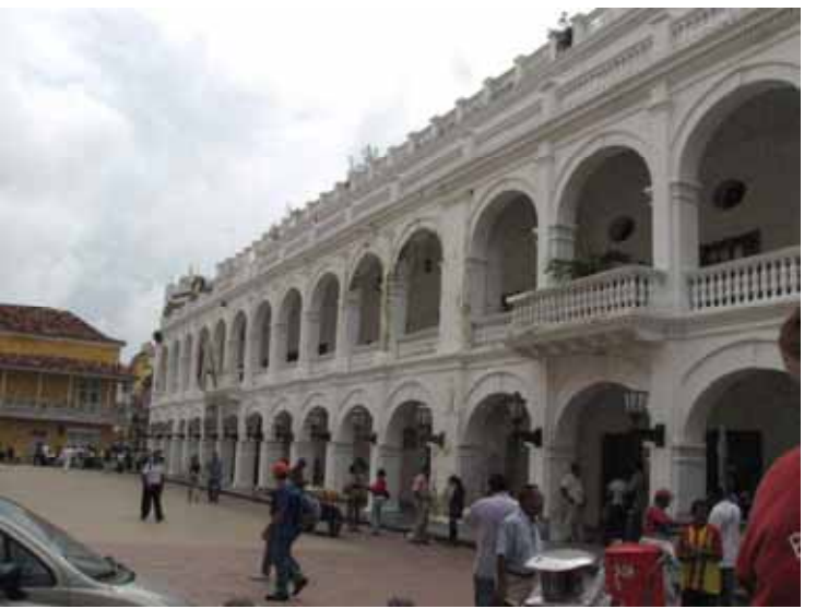
Outside the walled city we boarded the horse carriage for a ride lasting approximately one hour. We enjoyed traveling along the narrow streets of the old city, passing churches and squares, and seeing the Spanish colonial architecture for which the city is known.