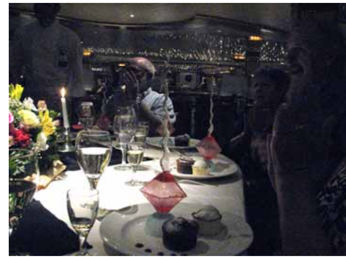
All in all, it was a fantastic experience, and well worth it.