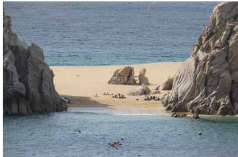
Lover's Beach- Gulf Side