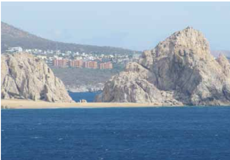
Lover's Beach-Pacific Side

As we got closer to Land's End at Cabo, I took pictures of both Los Arcos (The Arch), and Lover's Beach. Both of the features face both the Pacific Ocean and the Gulf of California.