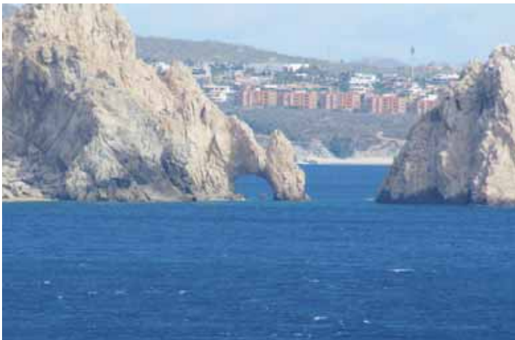
Los Arcos-Pacific Side