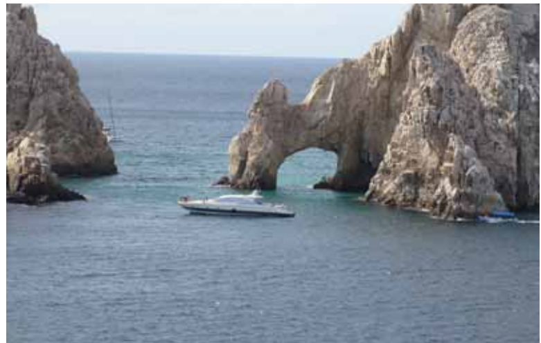
Los Arcos Gulf Side