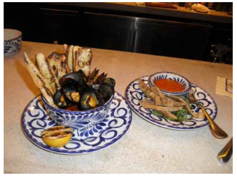
The CAVA Bar Pig's Ears During the times we were in the CAVA bar, there was a very talented classical guitarist and singer performing.