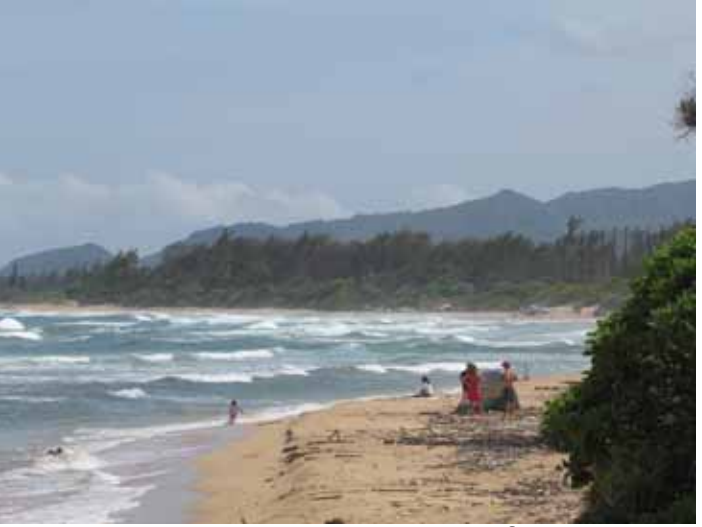
Monday was our snorkel day. We set up camp under the sea grape tree at the east end of Lawai beach and watched the ocean for a bit to determine conditions.