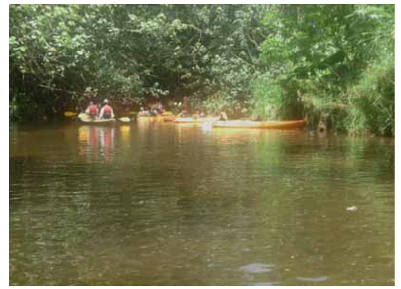
We beached our kayaks and started our hike to the falls. It had rained for few days previously and the trail was muddy and slippery. Add to that all the exposed tree roots trapping the water and mud, made for an arduous trek.